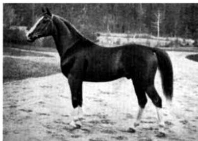
Bred in New Hampshire, Ribal stood at stud in Indiana before ending his career at Long Meadow Ranch in Arizona.